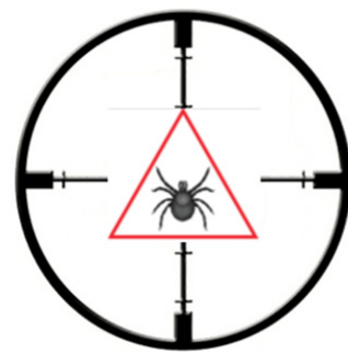
Image of tick in a rifle sight