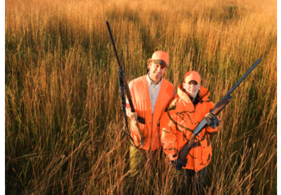
image of Hunters

Ticks can transmit serious and potentially fatal diseases like Lyme disease, ehrlichiosis and tularemia. Many of these illnesses can be treated effectively when caught early, so see your doctor right away if you have a fever, rash or flu-like symptoms after being in tick-infested areas. Frequent tick checks increase the likelihood of finding a tick before it can transmit disease.