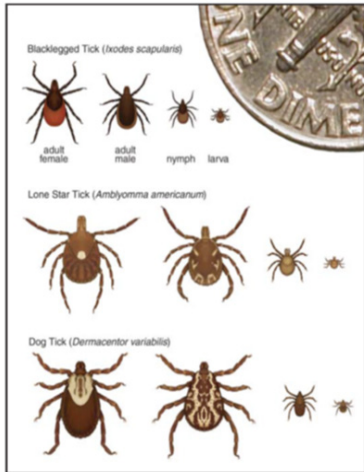
Images of the most common ticks in the United States

The most common ticks in the United States are the black legged ticks (which can carry the organisms known to cause Lyme disease, anaplasmosis, babesiosis, and Powassan disease), Lone Star ticks (which can carry the organisms that cause ehrlichiosis, tularemia and the Southern Tick-Associated Rash Illness (STARI)), and American dog ticks (which can carry the organisms which cause Rocky Mountain spotted fever and tularemia).