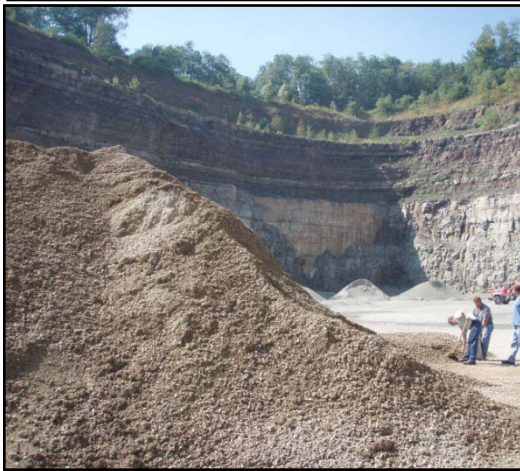
Aggregate from sedimentary rock in SW PA

AGGREGATE – A mixture of crushed rock or gravel separable by mechanical means. Focus on road applications.